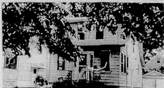
OPEN HOUSE - SUNDAY - 1-4PM NUTLEY 65 EDGAR PL. (Off Vreeland Ave.) Asking $139,000. Yantacaw School area, walk to park, 3 BR's, 1 1/2 baths, 1 car gar, maint. free, heated front porch, eat-in mod. kit.

100 Woodport Road Sparta, N.J. 07871 729-8727