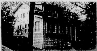
OPEN HOUSE - SUNDAY - 1-4PM 70 GLESS AVE. BELLEVILLE (Off Harrison St. Nutley) ASKING $129,900. TWO FAMILY, remodeled new kits, baths, elec. & plumbing, 75x100 lot, maint. free, 3 over 3, NICE HOUSE!!