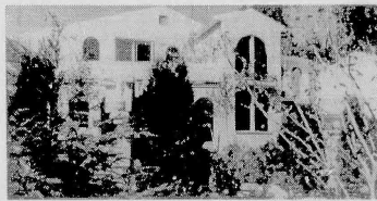
SPARTA - ARTIST'S VILLA Over two acres with gorgeous views, 4 balconies, fountains, 4 BR's, 4 baths, lots of marble & stained glass. Just Listed at $285,000. Call for details.