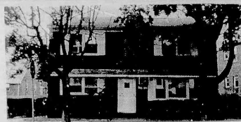
OPEN HOUSE - SUNDAY - 1-4PM 83 NEWARK PL. BELLEVILLE (Off Harrison St. Nutley). 2 FAMILY - 2BR's each apt., sep. gas utilities, 2 car masonry garage w/storage, fin. rec. rm w/bath in basement + 24x24 in-ground pool. ASKING $219,900.